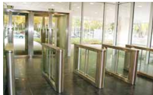
Gunnebo has supplied and installed gates to be situated in the main entrances and emergency exits of both buildings.

The owners of Pegasus City have said that this area of the new building will become the main business centre of the city of Madrid. It will consist of wide streets and green areas that will create a unique, modern and architecturally pleasing landscape. ■