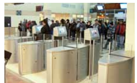
Gunnebo worked closely with Unisys on a design to meet their performance specifications and peripheral integration requirements.