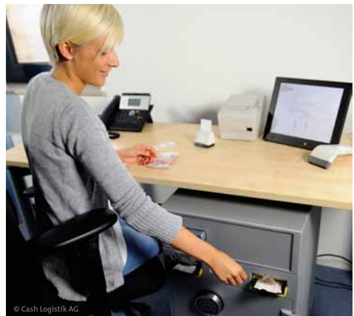
The system provides retailers with a completely autonomous banknote deposit solution.

Hundreds of SafeCash Retail Deposit Smart systems were supplied to different retail clients and offering security, traceability and visibility, as well as securing cash stock levels. ■