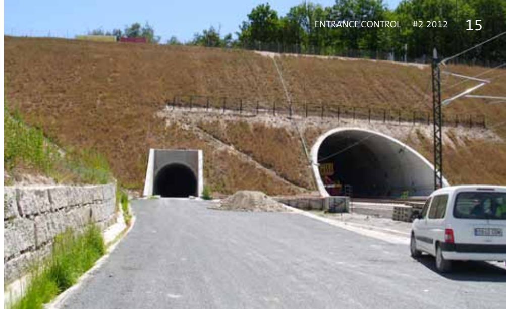
Two separate parallel tunnels, one for trains going north and the other for trains going south. In case of an emergency, passengers evacuate by crossing emergency galleries that connect one tunnel to the other horizontally every 250 metres.