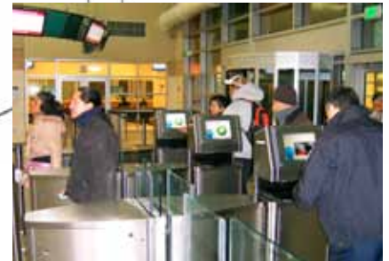
On a peak day up to 22,000 people walk across the Paso Del Norte Bridge.

If the efficiencies that are anticipated in this pilot project are realised, there would be interest in adding more lanes to the El Norte Facility, as well as extra pedestrian land crossings on the USA's southern borders. ■