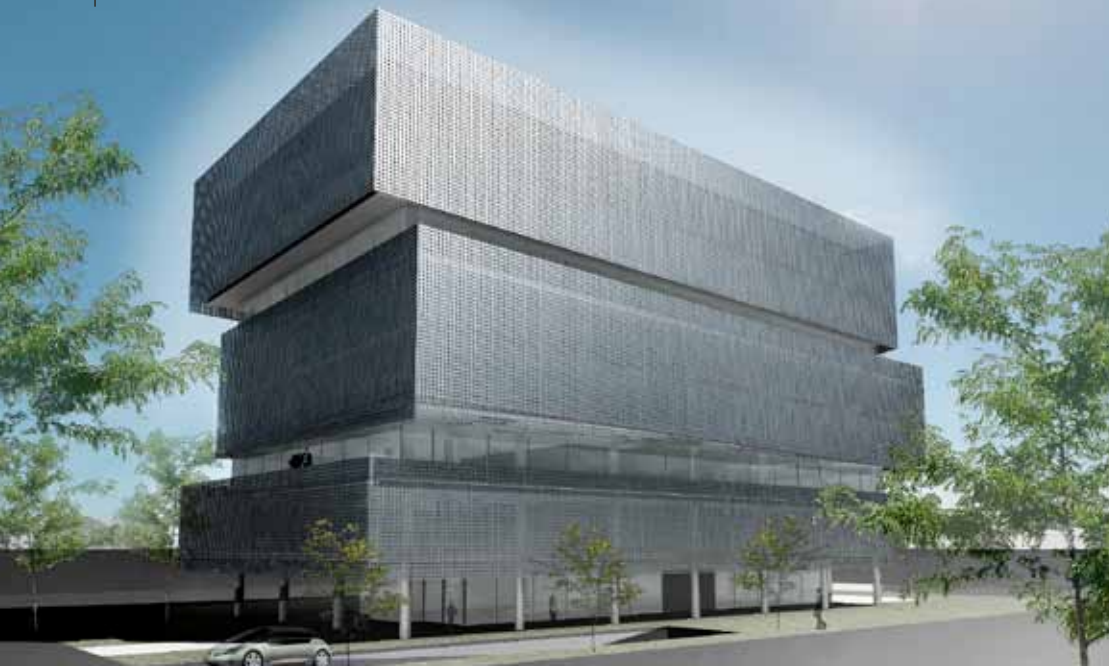
The AENA offices will host the Air Navigation Bureau. The public parts of the building have been designed by Estudio Lamela and the architect Gabriel Allende.