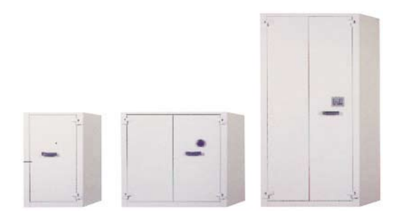
AF II security cabinets are available in three sizes

AF II cabinets are constructed using sheet steel for the body and double-panelled, 65mm-thick doors. The rounded door bolts are 20mm in diameter and protected by a relocking system which blocks the boltwork in the event of an attack.