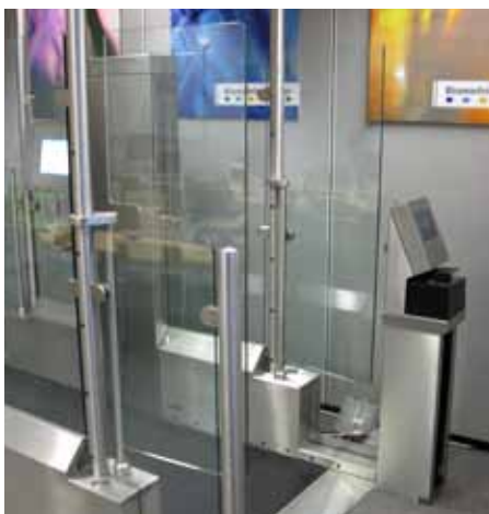
Biometric data is checked before the passenger enters