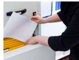
Safes and fire-resistant filing cabinets are part of the security packages being installed at Rezidor's new hotels.

R ezidor's core brand, Radisson Blu, is the largest upscale brand in Europe, and Park Inn by Radisson is one of the fastest growing mid-market hotel brands in Europe. Rezidor also maintains one of the industry's strongest pipelines in both segments with over 20 000 rooms to open within the next three years, and Gunnebo's back-office package is with them all the way.