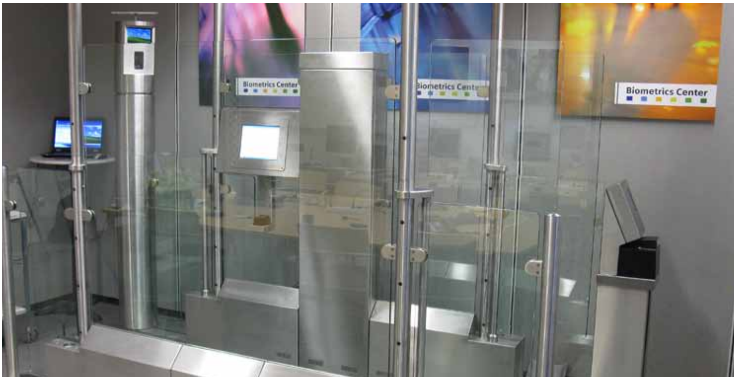
The eGate solution for automated border control will help deal with growing passenger numbers