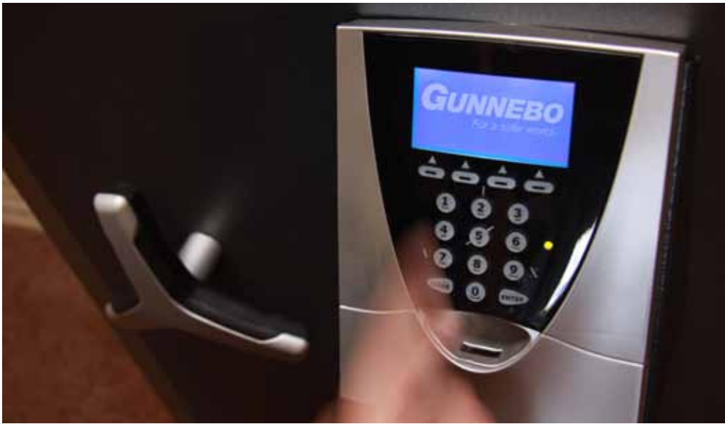
Gunnebo's modern high-security lock, the GSL 1000, has passed some of the most demanding security tests