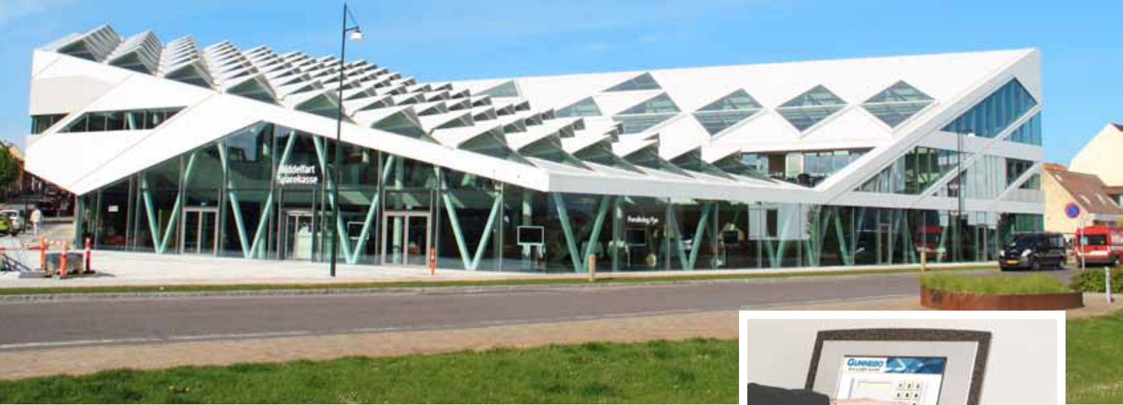
Automated safe deposit lockers at the Middelfart Sparekasse bank in Denmark saves both customers and staff time