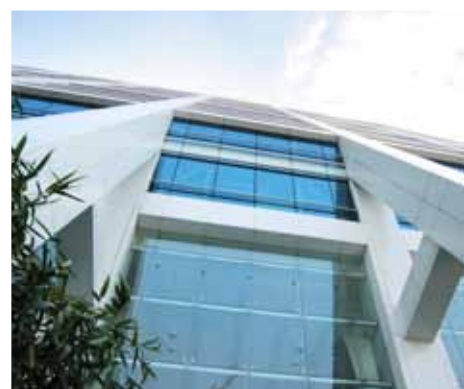
The new high-end commercial centre in Mumbai's business district has the latest entrance control solutions