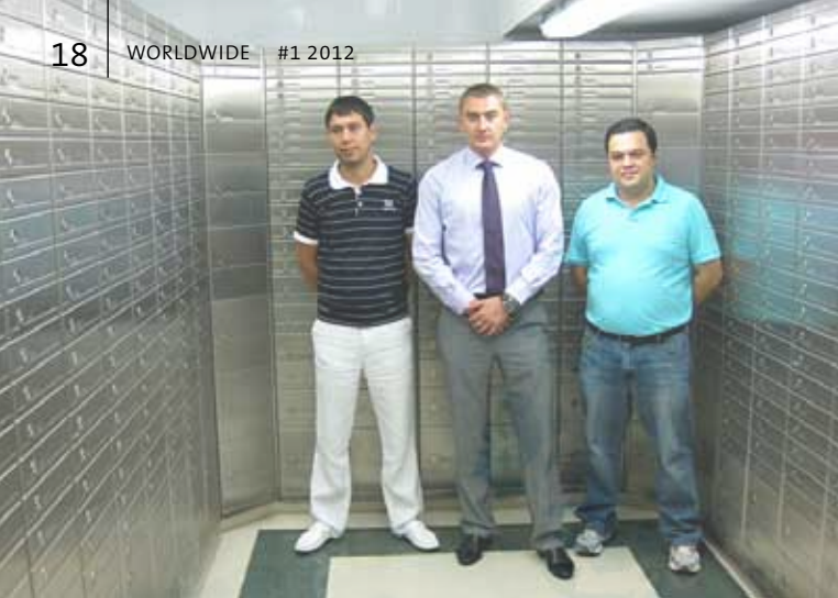
Uzbekistan has been added to the list of countries using Gunnebo solutions.