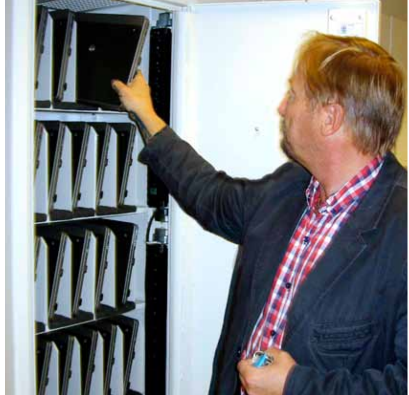
The two Rosengrens safes are well ventilated and have compartments for storing 25 laptops and power sockets for overnight charging.