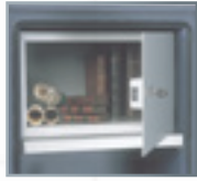
Interior fittings (from left): Shelf, lockable compartment